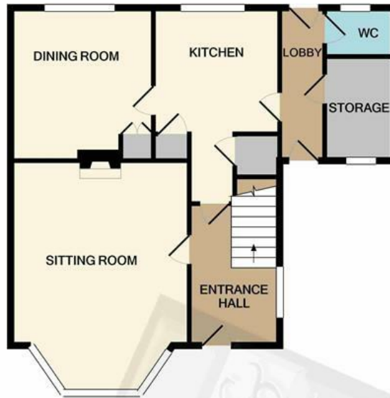
GROUND FLOOR APPROX. FLOOR AREA 535 SQ.FT. (49.7 SQ.M.)