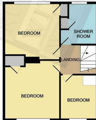
1ST FLOOR APPROX. FLOOR AREA 424 SQ.FT. (39.4 SQ.M.)

TOTAL APPROX. FLOOR AREA 959 SQ.FT. (89.1 SQ.M.)